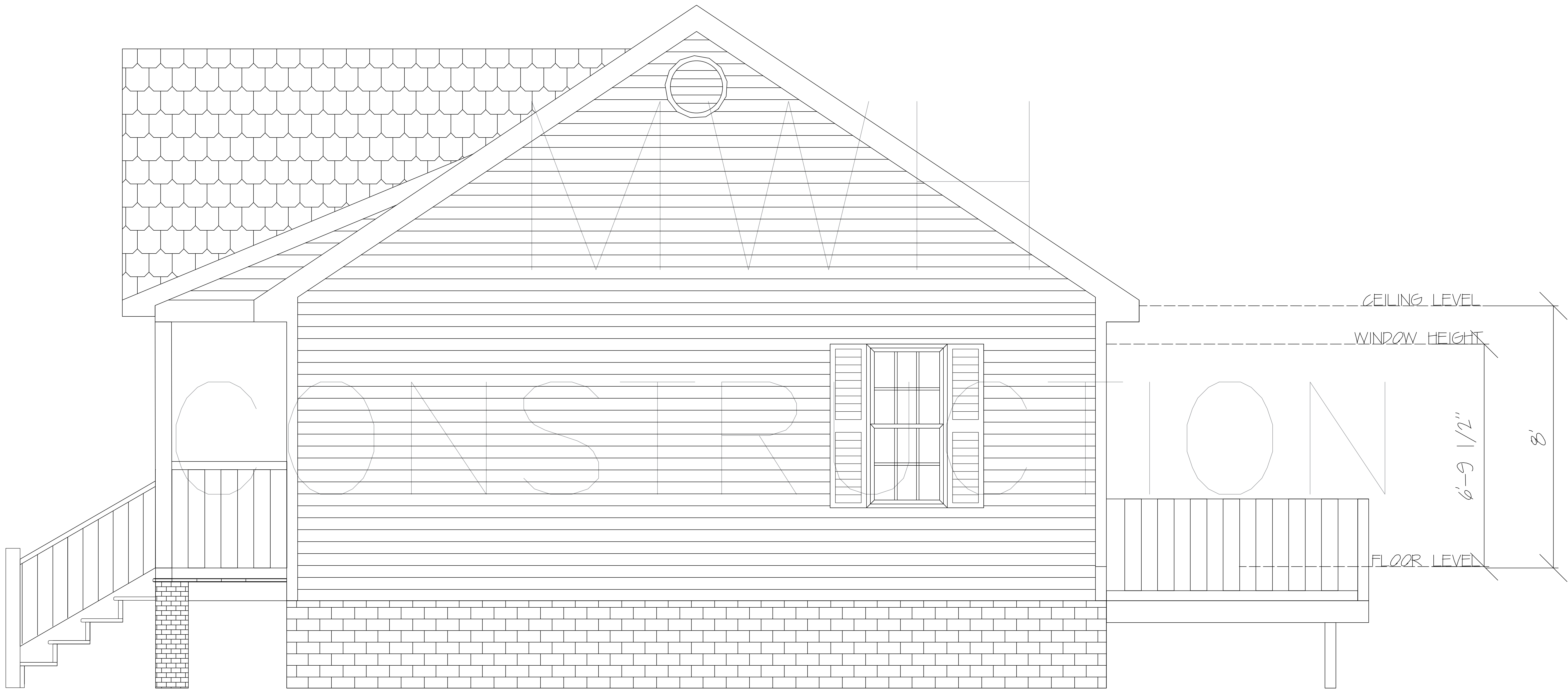
RIGHT ELEVATION VIEW