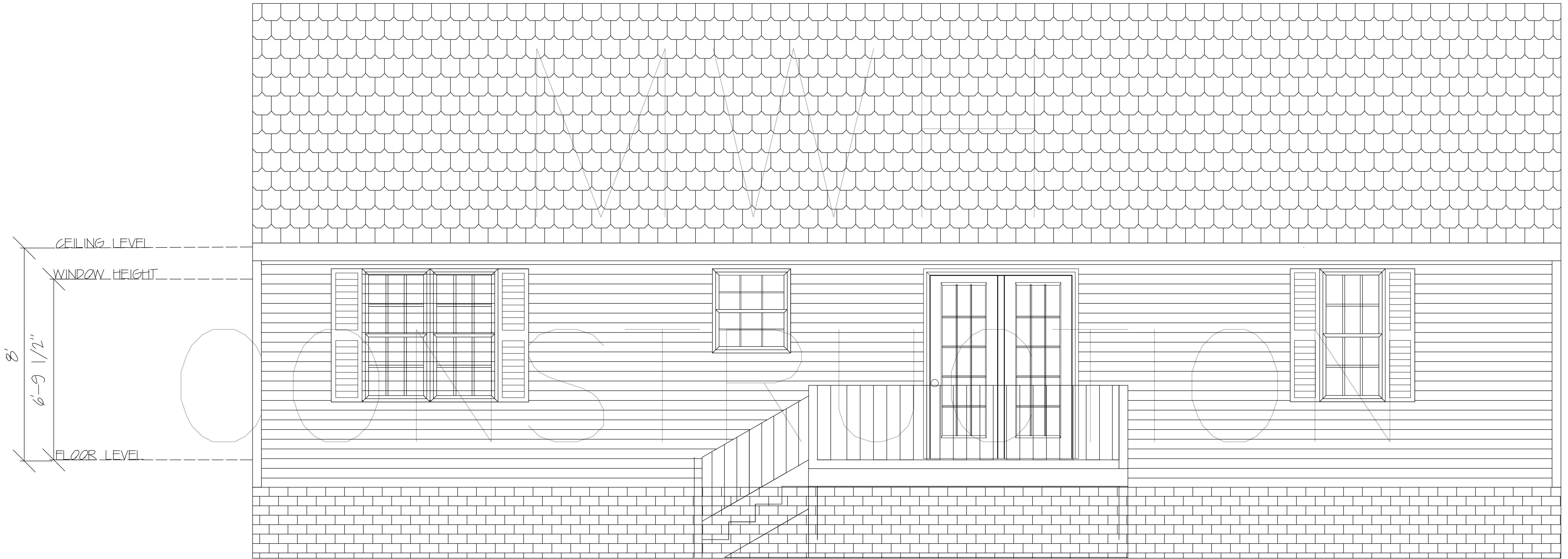
REAR ELEVATION VIEW