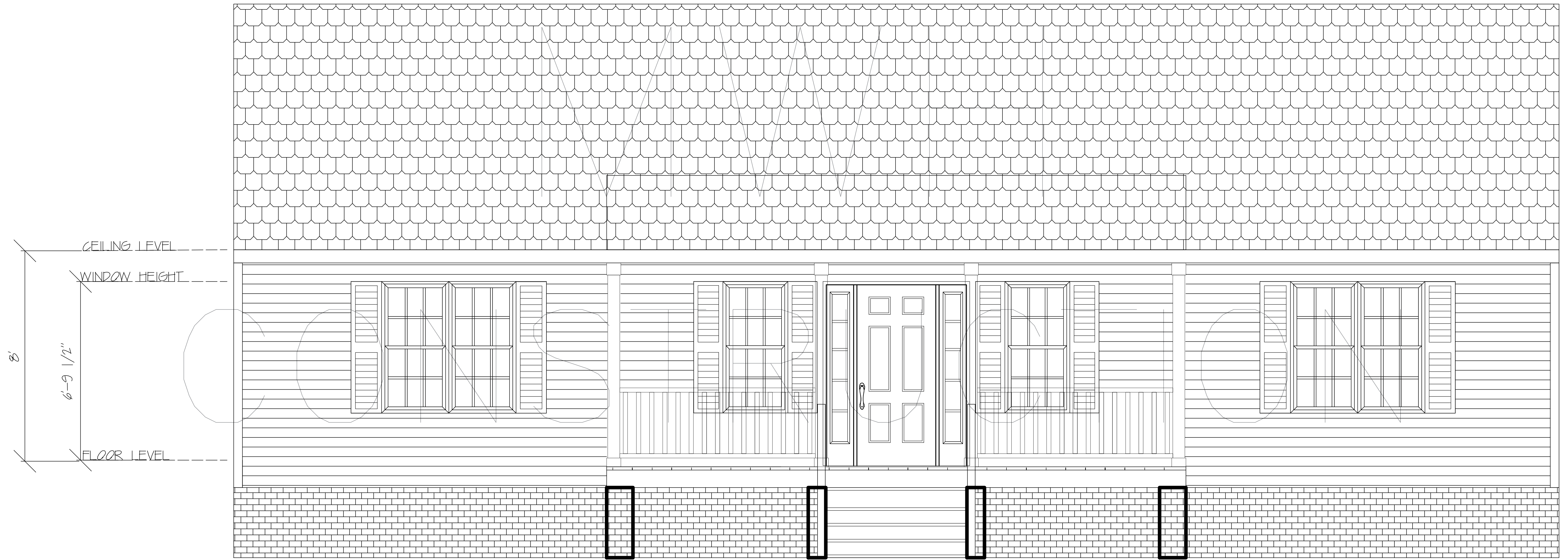
FRONT ELEVATION VIEW