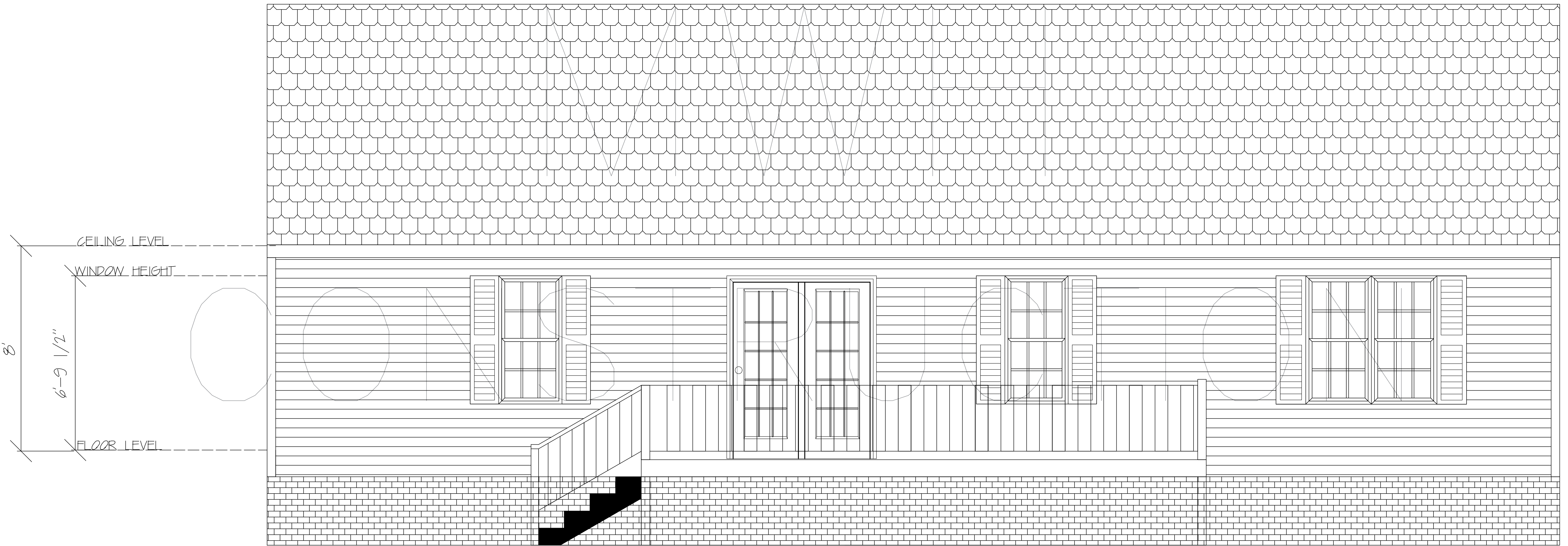
REAR ELEVATION VIEW