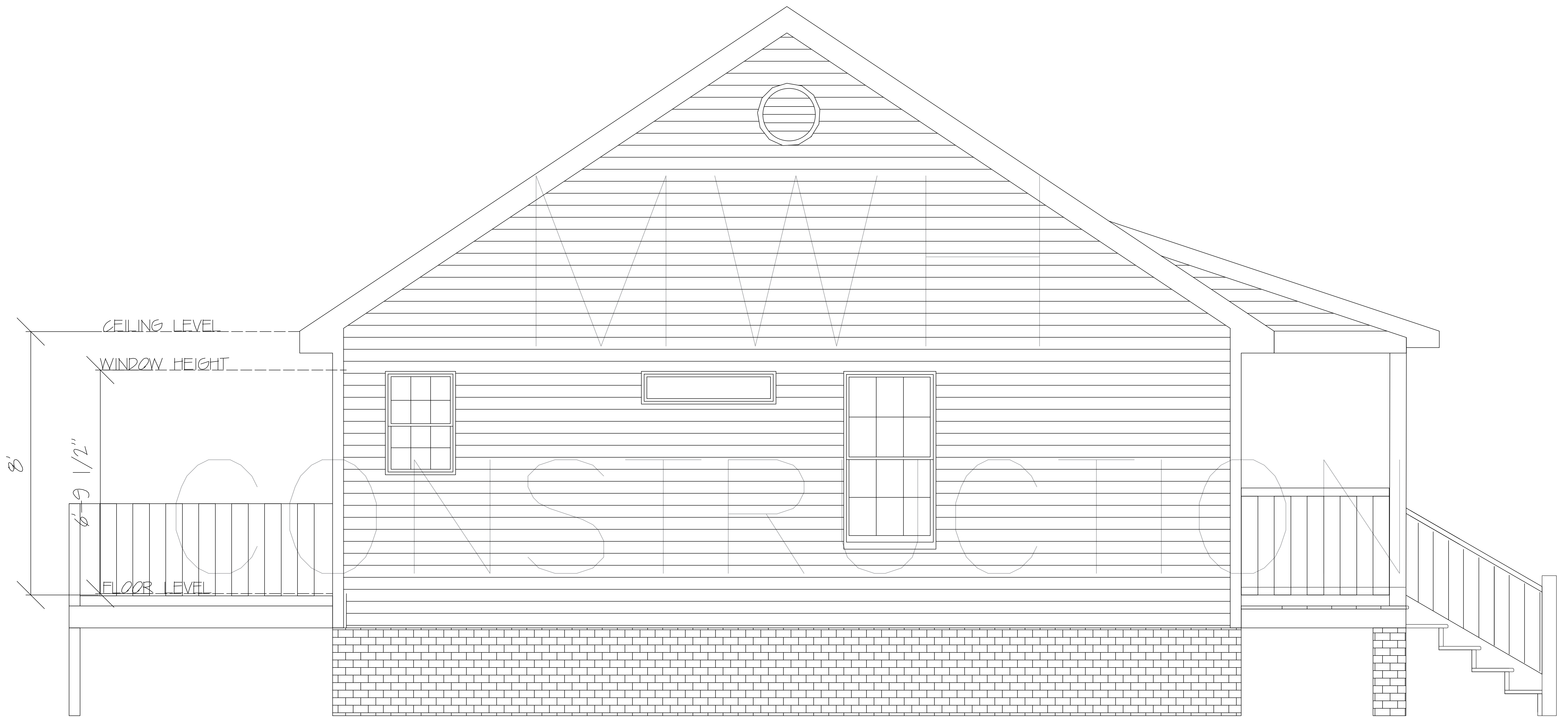
LEFT ELEVATION VIEW